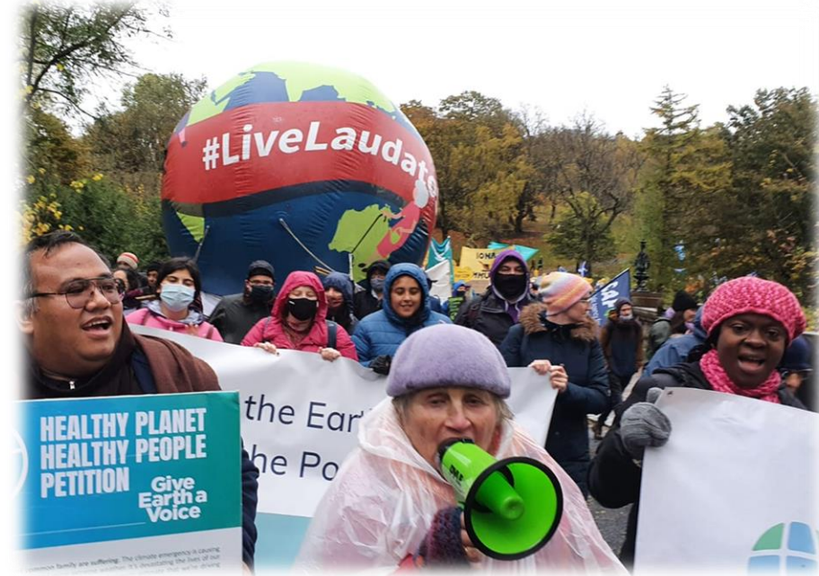
The Great Turning