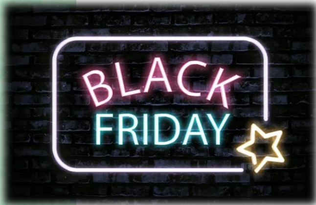
Business As Usual