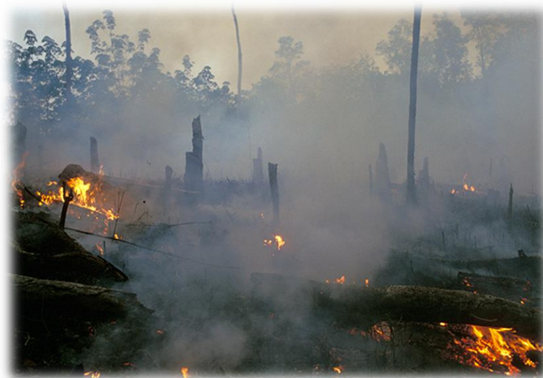
The Great Unravelling