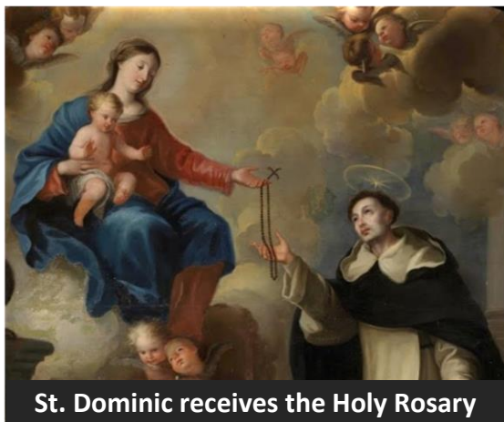
St. Dominic receives the Holy Rosary

Thus, the simple prayer of the Rosary marks the rhythm of human life (St. John Paul II).