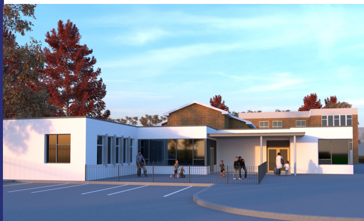
Artist's impression of the redeveloped Derryvolgie Avenue school buildings

You can use the live chat function on the consultation website www.stbridesconsultation.co.uk to talk to a member of the project team who will be available Monday - Friday, 9am - 5pm to respond to your queries.