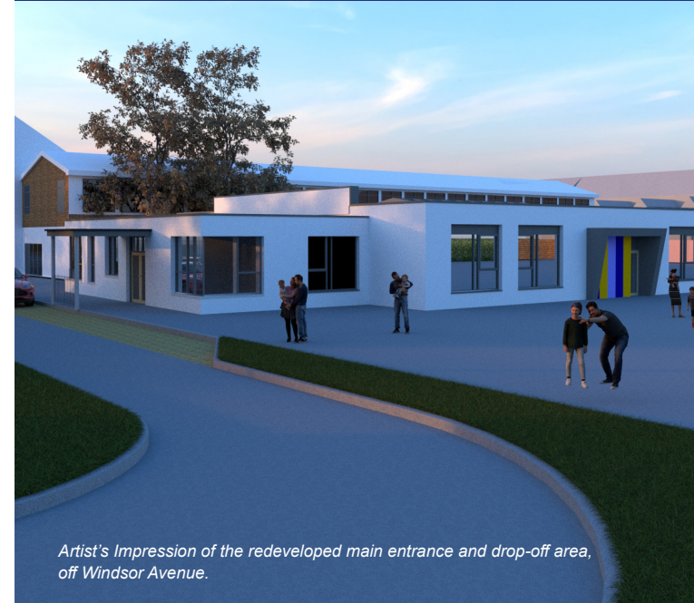
Artist's Impression of the redeveloped main entrance and drop-off area, off Windsor Avenue.

Delivering a bright future for St Bride's pupils, through a major extension of the primary school.