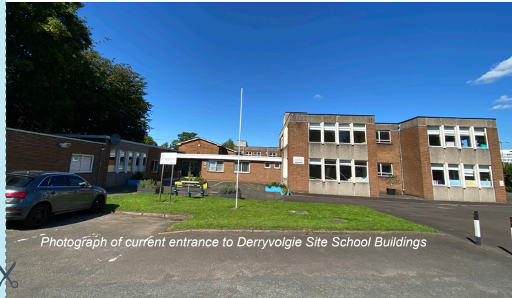
Photograph of current entrance to Derryvolgie Site School Buildings

Please submit all feedback by Wednesday 14 September 2022